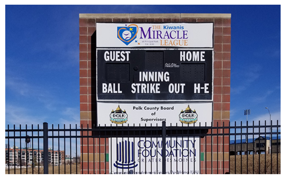
Phase III will be enhancing our player experience by upgrading our digital scoreboard to an interactive video board.