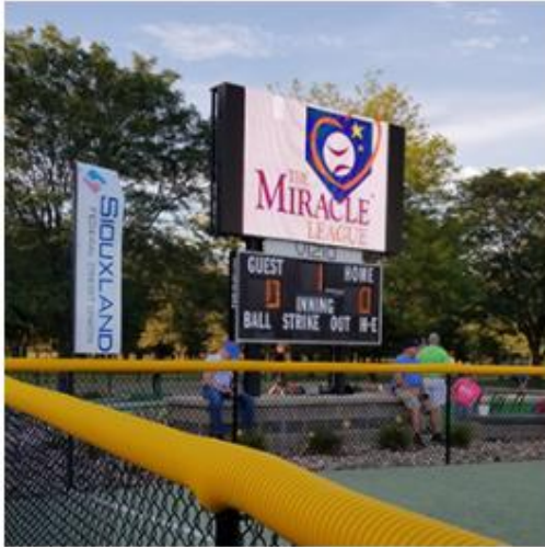
The Sioux City Miracle League hosted the 2019 ALL STAR ML Weekend. Great planning, lots of fun, and a fabulous facility.