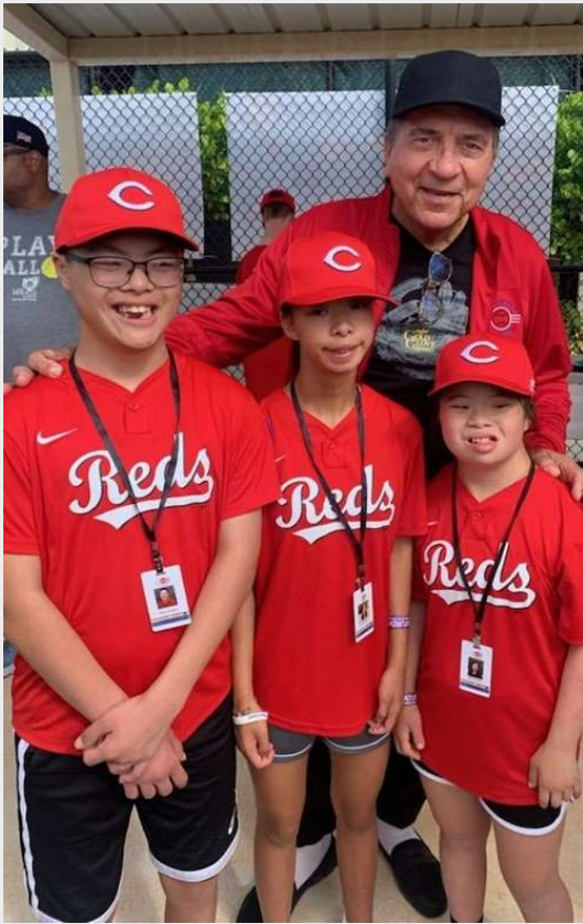
Our Marlins players got to meet Johnny Bench (catcher), Cincinnati Reds All Star and Hall of Famer!