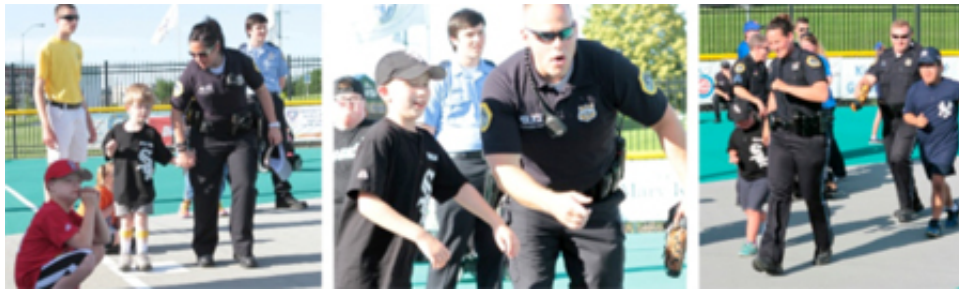
Iowa Cubs June 13th