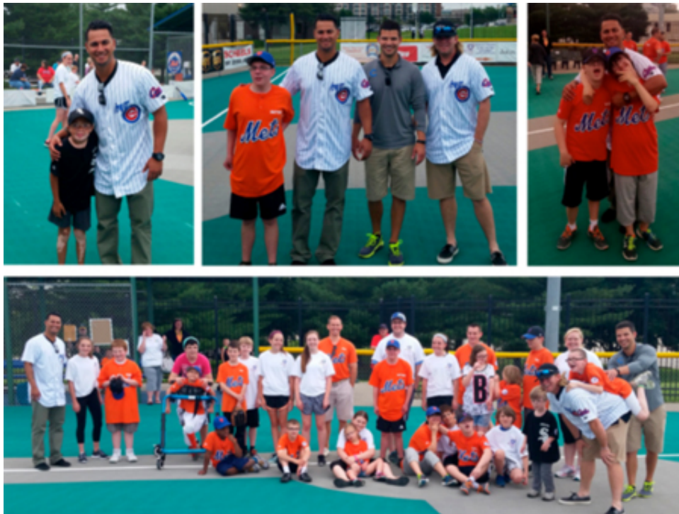
Barnstormers Game - June 16th